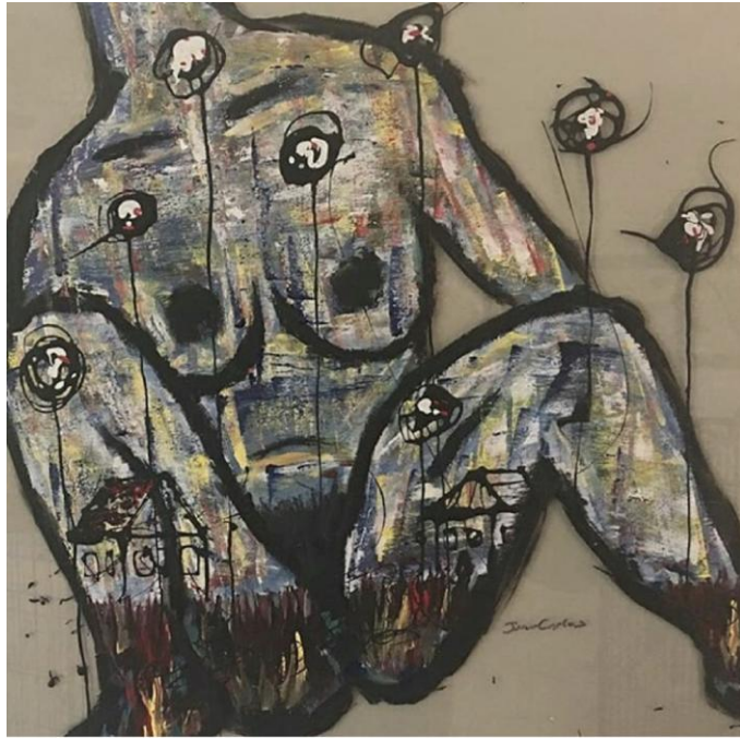
The Town JuanCarlos rLora 20 x 20 in Acrylic on glass $6,000

Contact info: ArtToSaveLives Contemporary 9705 NE 2 nd Ave, Miami, FL 33138 Luba Kladienko-Ramirez gallery@arttosavelives.org 845-548-5161