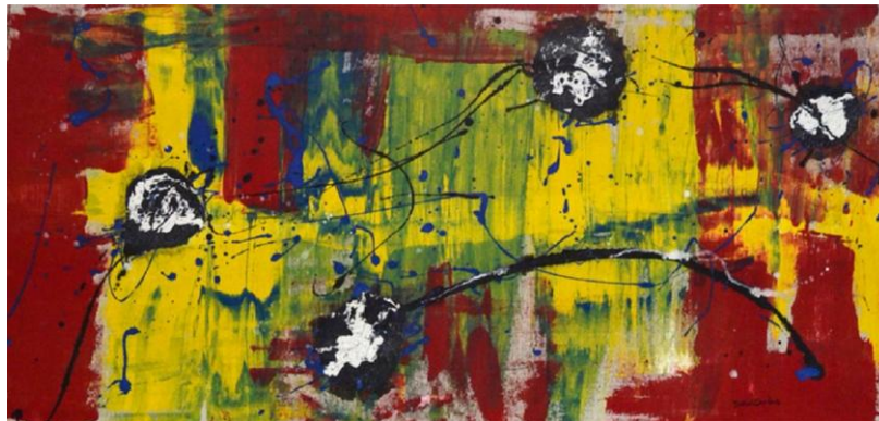
Orbital Landscape JuanCarlos rLora 19 x 40 in Acrylic and oil on canvas $3,500

Particles are the point where Flor's body disintegrates into Particles or cosmic dust, if you will, and floats off into the Cosmos, to become components of galaxies in the vastness of space.