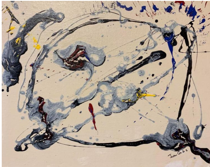
Sistema JuanCarlos rLora 16 x 20 in Acrylic and oil on board $1,500

Contact info: ArtToSaveLives Contemporary 9705 NE 2 nd Ave, Miami, FL 33138 Luba Kladienko-Ramirez gallery@arttosavelives.org 845-548-5161