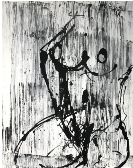
Rapture JuanCarlos rLora 20 x 16 in Acrylic and oil on canvas $3,500

”I love exploring the female figure, as it is the ultimate form, Mother Nature herself.”