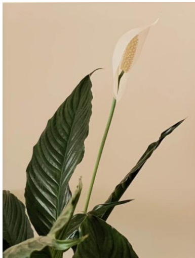
Loca, 2022 Photography on Hahnemühle Photo Rag cotton paper 11 x 8.5 in $95.00

Contact info for inquiries: ArtToSaveLives Contemporary 9705 NE 2 nd Ave, Miami, FL 33138 Luba Kladienko-Ramirez gallery@arttosavelives.org 845-548-5161