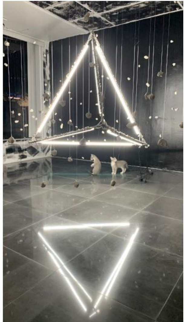
Left: JuanCarlos rLora - Bermuda, 2022, installation view with Nova / Right: JuanCarlos rLora - Bermuda, 2022, installation view with kittens