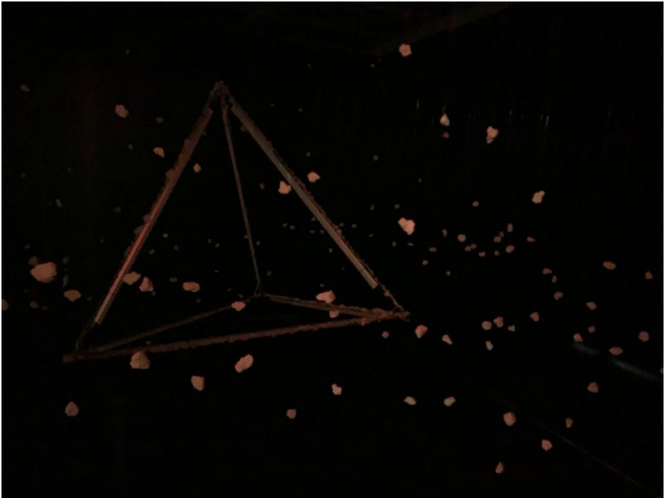
JuanCarlos rLora - Bermuda, 2022, installation view