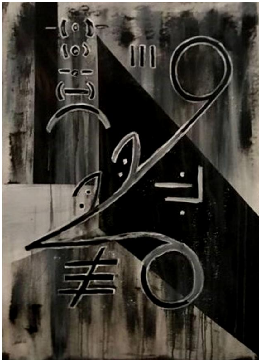
Day & Night Juan Carlos Lora 58" x 42" Acrylic on cotton $10,000