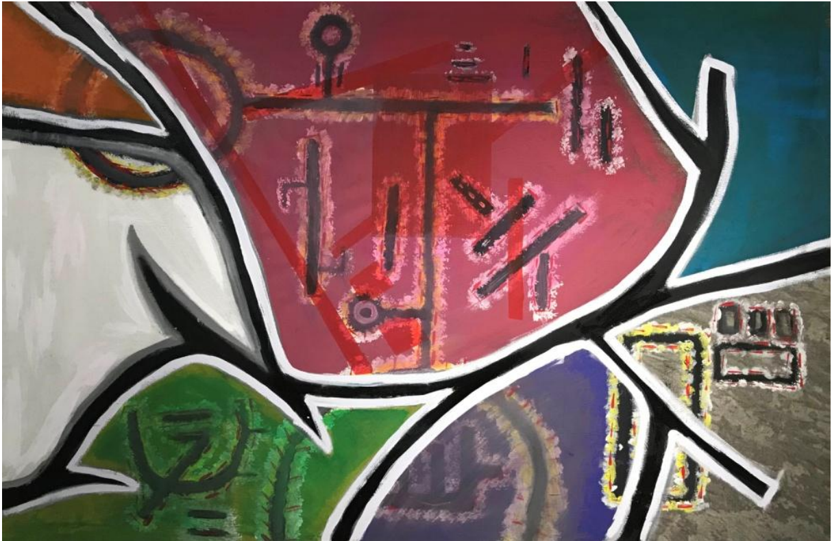
Intrigue JuanCarlos rLora 39" x 59" Acrylic and tempera on cotton $10,000