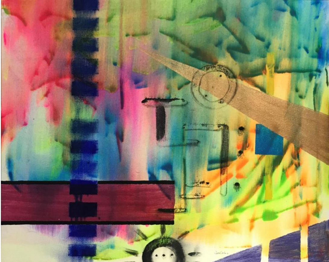
Sound JuanCarlos rLora 24" x 30" Acrylic on canvas $4,500

Contact info: ArtToSaveLives Contemporary Luba Kladienko-Ramirez gallery@arttosavelives.org 845-548-5161