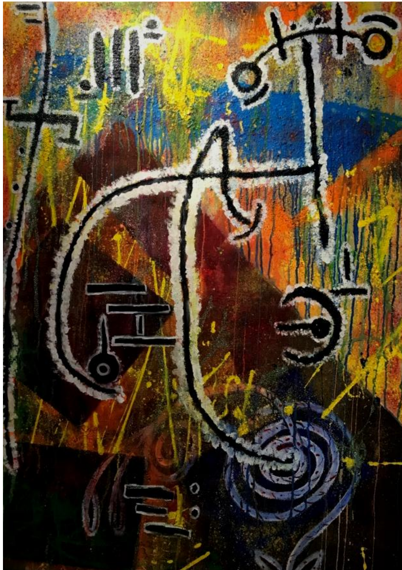
Soil JuanCarlos rLora 55" x 40" Acrylic and tempera on cotton $10,000