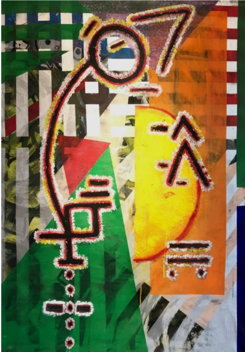
The Sun Juan Carlos Lora 62" x 44" Acrylic and tempera on cotton $11,000