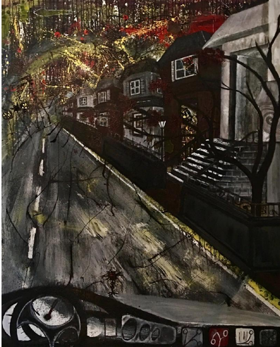
JuanCarlos rLora Autumn Ghost Town Acrylic and oil on canvas 64.5 x 52.5 in Inquire