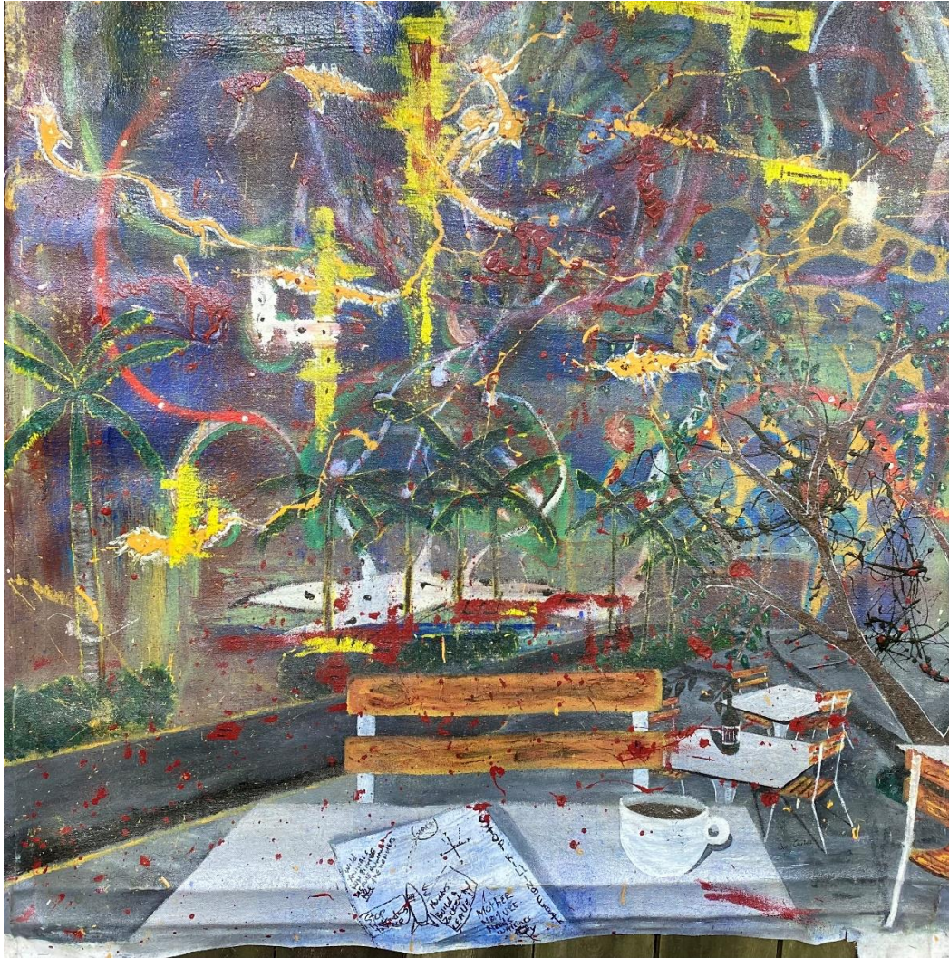
Juan Carlos Lora Ocean Drive (News Café) Acrylic on Canvas 40 x 40 in Inquire