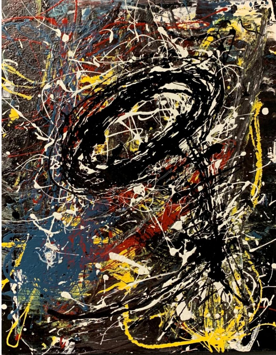
Juan Carlos Lora Hollow III Acrylic and oil on canvas 20 × 16 in $6,000