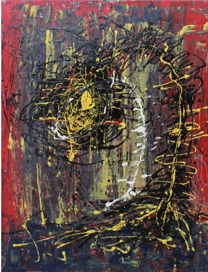
JuanCarlos rLora Hollow II Acrylic and oil on canvas 20 × 16 in $6,000

Hollow II has a strong emotional pull, with the flower being in the center of the stage with a white outline of the hollow flower within. Its vivid, bold and dark tones transport the viewer into the land of otherworldly and imaginary. The combination of colors is particularly striking as one examines the piece in detail. Its deep, rich and saturated background gives way to a silhouette of a flower, which is made by an almost stitch-like streaks technique.