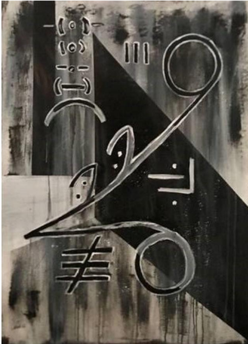
Day & Night Juan Carlos Lora 58" x 42" Acrylic on cotton $10,000