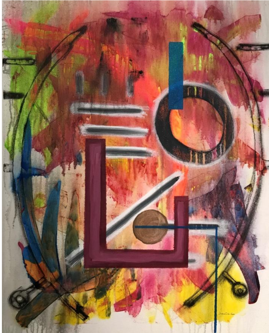
Energy (Love) JuanCarlos rLora 30" x 24" Acrylic and tempera on canvas $4,500