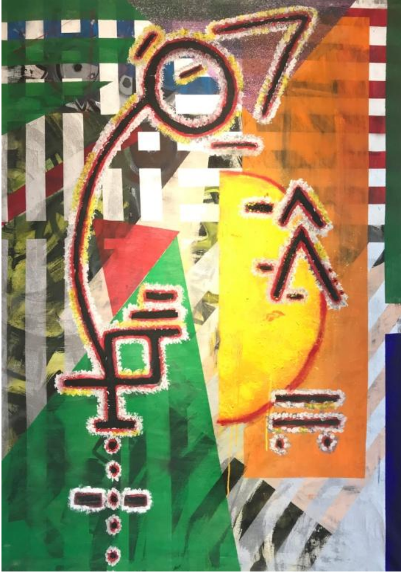
The Sun Juan Carlos Lora 62" x 44" Acrylic and tempera on cotton $11,000