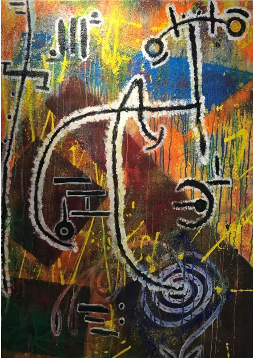
Soil JuanCarlos rLora 55" x 40" Acrylic and tempera on cotton $10,000