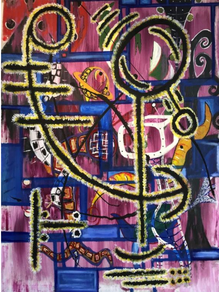
Fauna JuanCarlos rLora 56" x 42" Acrylic and tempera on cotton $11,000